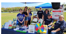
KC of Carrollwood promoting the Kiwanis Family