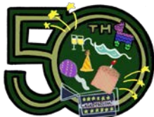
Florida Kiwanis Foundation Fiftieth Anniversary Today's Future - Tomorrow's Children