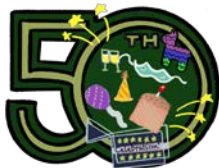
Florida Kiwanis Foundation Fiftieth Anniversary Today's Future - Tomorrow's Children