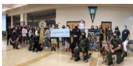
Training equipment for the Canine Unit of the Martin Co Sheriff’s Office